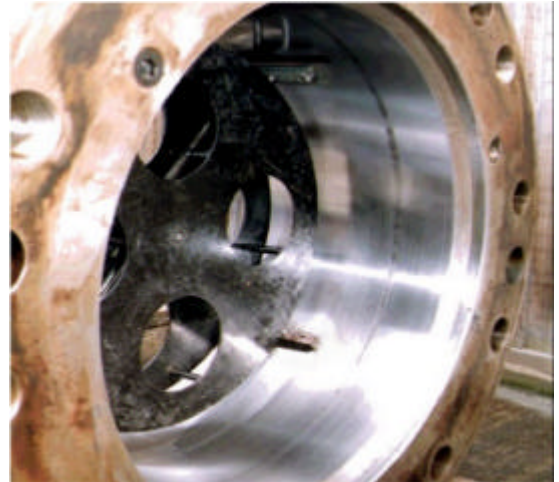
Internal Honing of a 900mm Ø Tailshaft Bearing