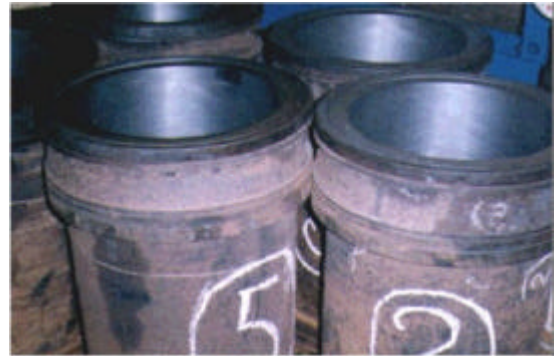
Internally Honed 400mm Ø Cylinder Liners