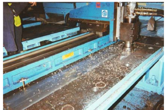
Milling of a 2.5M long pedestal base for a wheel testing machine at Dunlop