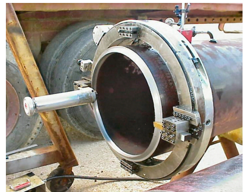
Pipe bores and outside diameters machined to suit matching pipe work.