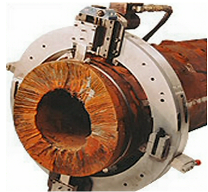
Pipe of any wall thickness can be machined.