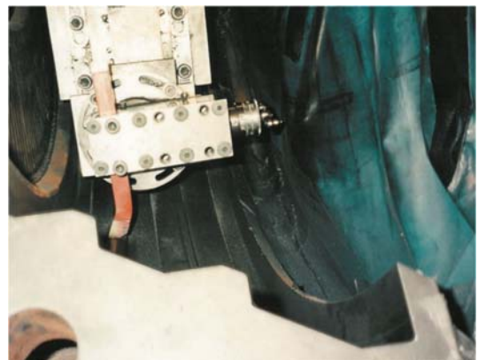
Machining A Casing To A New Profile To Increase Efficiency