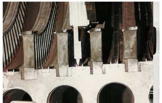
Machining To Give Correct Clearances On The Seal Strips